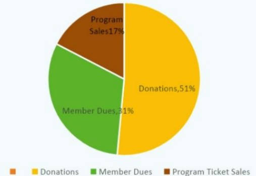
23-24 PROFITS BY CATEGORY

Our monthly fixed expenses are approximately $2,000 per month, in support of our programs and library. As you can see, we will continue to rely on member donations to fund our programs. We will be developing a fundraising plan to keep us going strong, and count on your support.