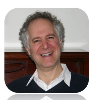
Good Shepherd Center February 7th 7-9 pm February 8<sup>th</sup> 10 am – 4 pm See pages 8-9 for CEUs and Pricing

Koans, stories of encounters between Zen practitioners, are myth-like in their resonance across time and culture. Their concise form is rich with archetypal imagery, which, in some stories, provides perspective on the process of individuation.