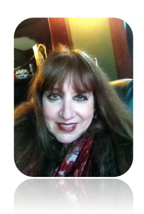
November 14th 7-9 pm