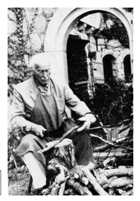
The original Tower at Bollingen.

encourage you to come early and bring your dinner or buy it at the market vendors. We will meet outside if the weather is willing.