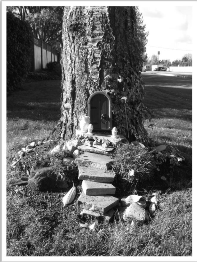
Imagination: tiny home for spirits in my neighborhood